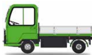
PE 20 Towing Capacity 2 t