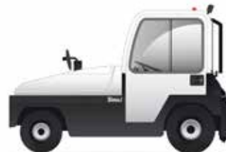
TE 300R Towing Capacity 30 t