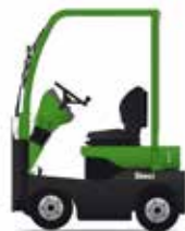
TE 80 Towing Capacity 8 t