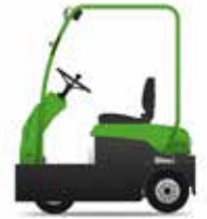
TTE 71 Towing Capacity 7 t