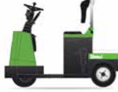
TTE 30 Towing Capacity 3 t