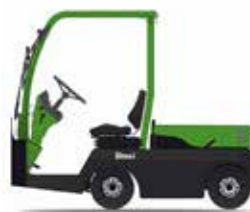
TE 80IXB Towing Capacity 8 t