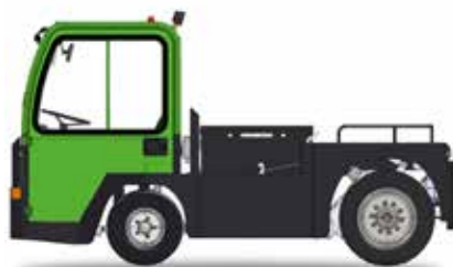
TE 500RR Towing Capacity 50 t