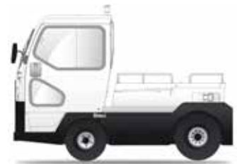
TE 152 Towing Capacity 15 t