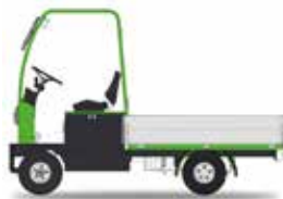
PE 15 Towing Capacity 1.5 t