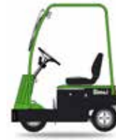
TTE 40 Towing Capacity 4 t