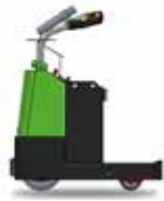
TTE 15 Towing Capacity 1.5 t