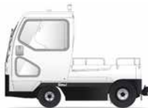
TE 291 Towing Capacity 29 t