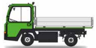
PE 30 Towing Capacity 3 t